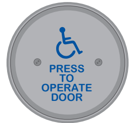
#59R4-HSS (Stainless Steel with Blue Paint Filled Legend)