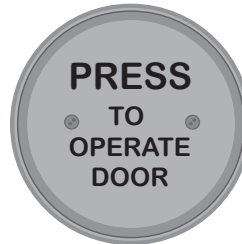
#59R4-P (Stainless Steel with Black Paint Filled Legend)