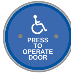
#59R4-H (Blue Powder Coat with White Paint Filled Legend)