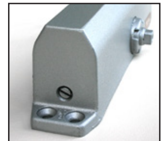
• 1803-BC, 1804-BC and 1805-BC Series Back-Check Adjustment Valve