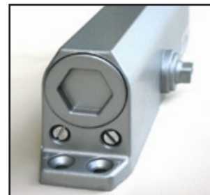
• Closing and Latching Adjustment Valves