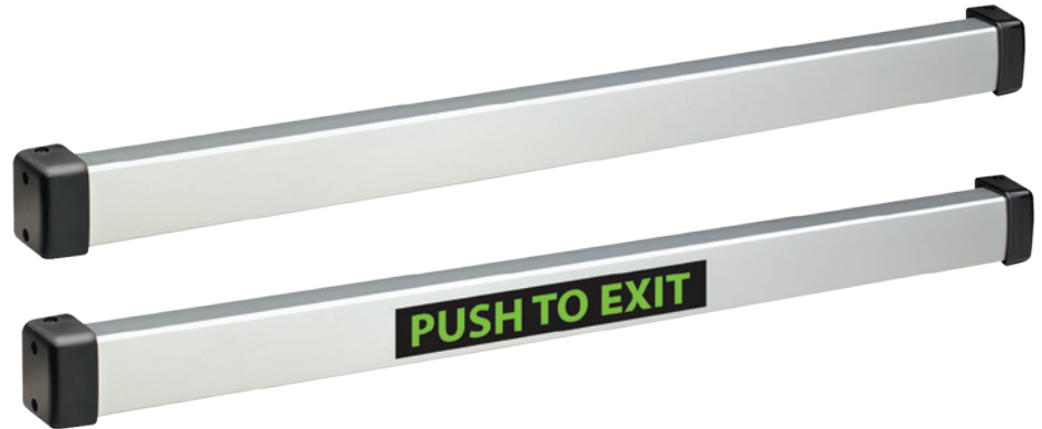
Field installed sign 1" h Green Letters