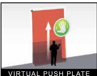
VIRTUAL PUSH PLATE