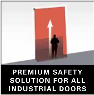
PREMIUM SAFETY SOLUTION FOR ALL INDUSTRIAL DOORS