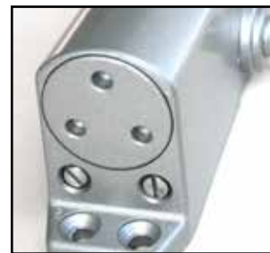
• 850 & 880 Series Closing and Latching Adjustment Valves