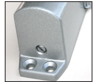
• 880 Series Back-Check Adjustment Valve