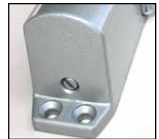
• 880 Series Back-Check Adjustment Valve