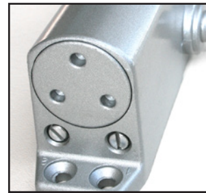
• 850 & 880 Series Closing and Latching Adjustment Valves