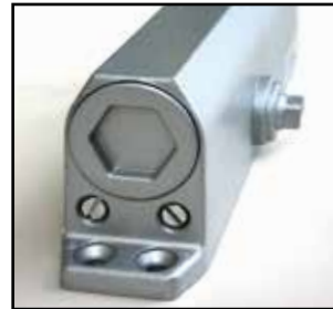
• Closing and Latching Adjustment Valves