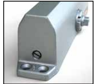
• 1803-BC, 1804-BC and 1805-BC Series Back-Check Adjustment Valve